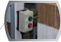
Powered hopper lift