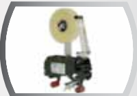
3" HSD 2000 ET II Tape Heads