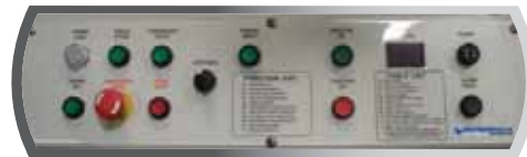
Automatic and Manual mode operation with failure diagnostic LED