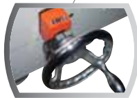
Analog counters simplify changeover