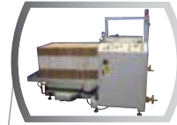
48" powered hopper holds up to 150 cases