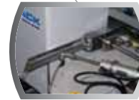
Pneumatic arm squares cases before sealing