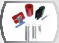
Spare parts kits