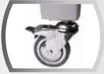
Heavy duty casters