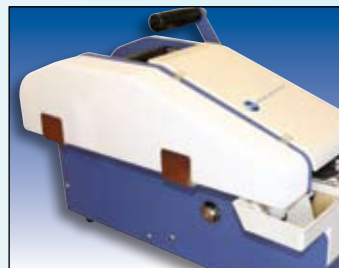
Extra-large 60oz water bottle reduces downtime