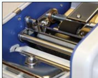
Stainless steel "arching" guillotine cutter for clean cuts