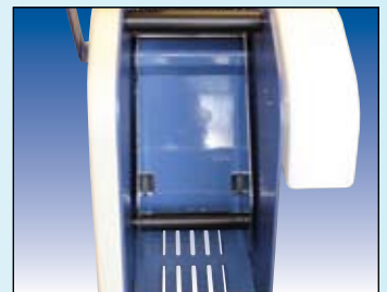
Extra-wide roll carriage